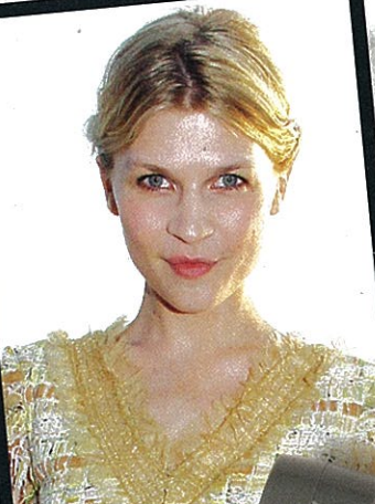
Parisian actress Clémence Poésy in a tweed Chanel frock. It just doesn't get any more French!

Soak up the culture, not the solar radiation. Swapping your regular moisturizer for light SPF lotion keeps you covered as you hop from museum to landmark.